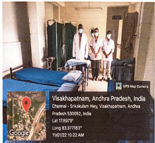
photo 4 shows the residential wards for patients