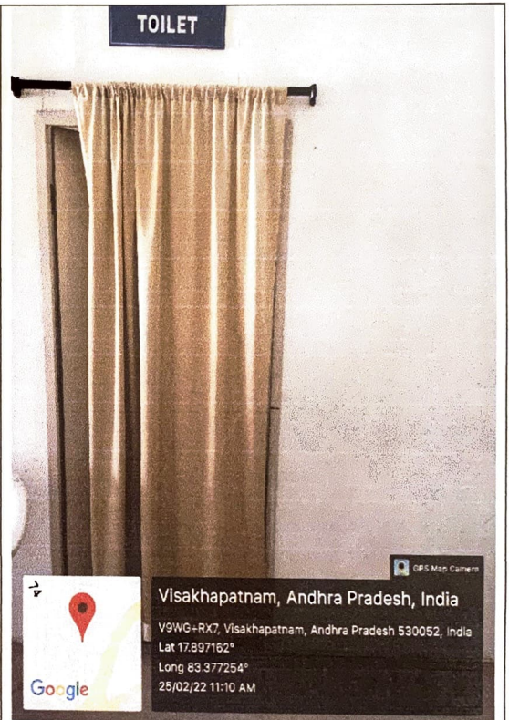
photo 2 shows the rest room facility at rural health center.

d. v. s. r. b. PRINCIPAL Anil Neerukonda Institute Dental Sciences Sangivalasa-531 162 Visakhapatnam Dist.