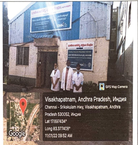
photo 2 shows entrance for rural health centre for new registrations