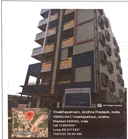
Photo 1 shows overview of rural health centre at Anandapuram.

Academic Year 2020-21 Geotagged Photos – Rural Health Centers